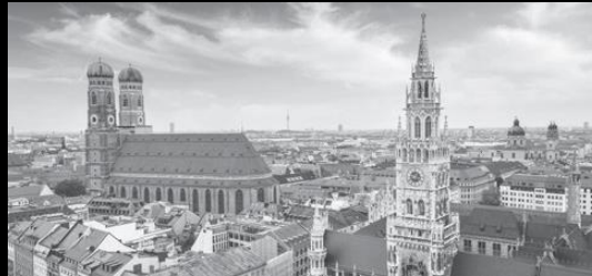
MUNICH | OCTOBER 15, 2021 / 980 EUR