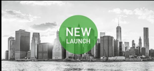
NEW YORK CITY | NOV 12, 2021 / 980 USD