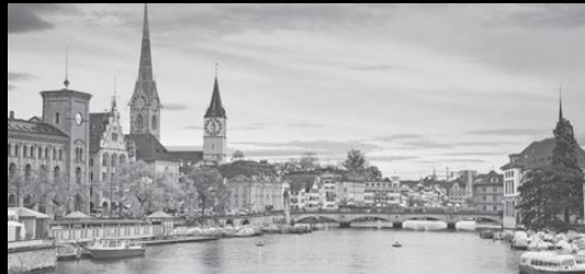
ZURICH | OCTOBER 22, 2021 / 980 CHF