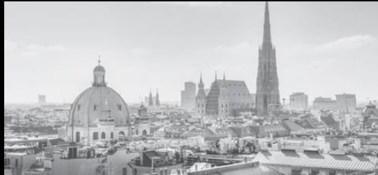
VIENNA | OCTOBER 21, 2021 / 980 EUR